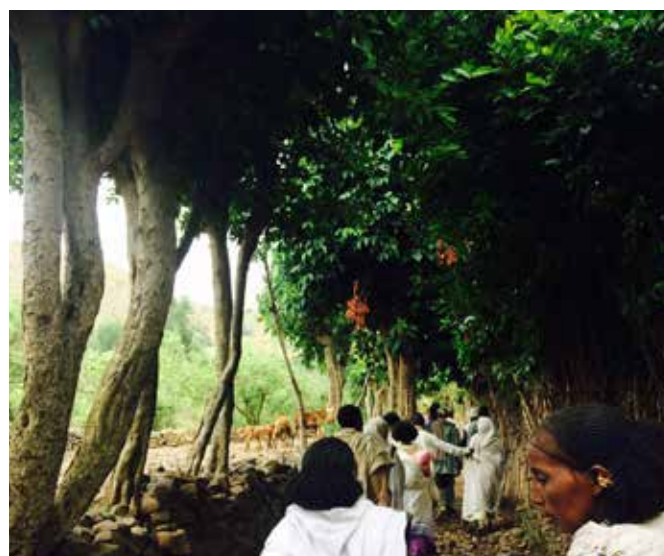
Planted tree species extensively in silvopastoral systems along backyards, farm boundaries and village roads.

In view of its benefits, local farmers in northern Ethiopia have planted the tree species extensively in silvopastoral systems along backyards, farm boundaries, village roads, soil and water conservation structures, and wastelands, despite being coerced by government officials to plant other tree species. This practice has created green, biodiverse islands of climate-resilient farms amidst the drought-stricken landscapes of northern Ethiopia. Local communities have also developed indigenous protocols for the planting, propagation, and use of F. thonningii .