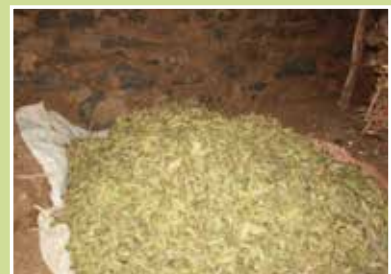
Dried and stored foliage