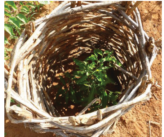
Tree planting and protection.

This case study was produced by the Oakland Institute. It is copublished by the Oakland Institute and the Alliance for Food Sovereignty in Africa (AFSA). A full set of case studies can be found at www.oaklandinstitute.org and www.afsafrica.org .