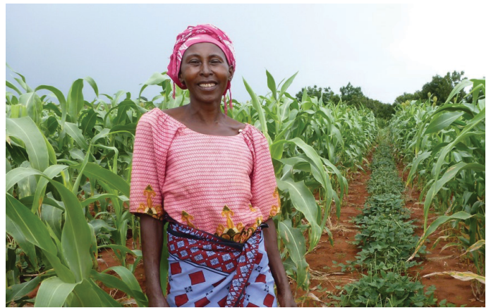
Intercropped grains with legumes.

The farmers then implemented at least one of the three principles of conservation agriculture on their own land. The most popular practices were minimum soil disturbance (ripping or using no-till direct planters or jab planters) and keeping the soil covered (not burning crop residues, not allowing animals to graze freely, and planting Lablab ). In mid-2005, 18 of the 22 group members ripped their fields; four rotated their crops; and all of them planted Lablab . During the regular weekly meetings, they were able to share their experiences and compare notes with the other group members.