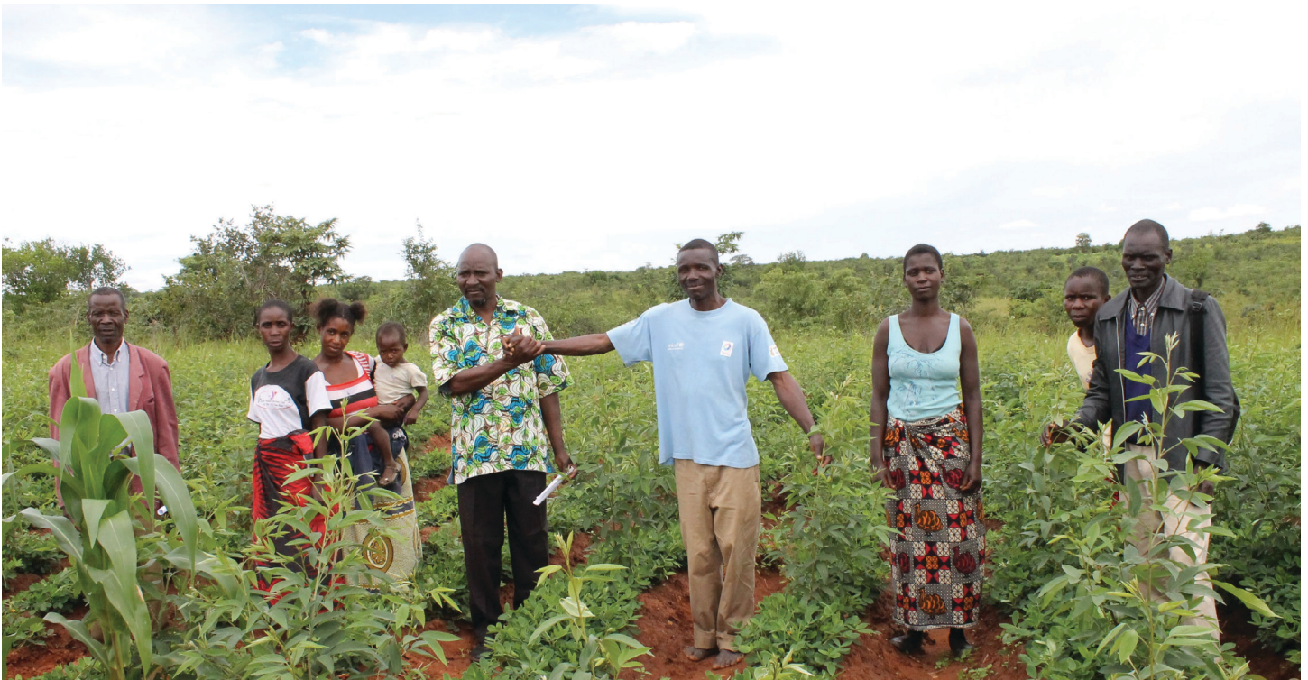
Chilida village area experimenting group, with their harvest of finger millet.