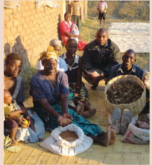
Farmers discussing field observations, Kabwanda.

A farmer-to-farmer teaching model was implemented, allowing farmers to participate in field days and to work with more experienced peers. A “mother-baby” strategy was used to educate about the management of all the legume technologies used in the study. In each participating community, trials of all five legume options were grown in central village plots maintained by the FRT to allow direct observation by farmers (i.e. the “mother” plot). Individual farmers simultaneously tested one to two of the legume options in “baby” trials (10x10 meter plots) at their home and compared them to their normal cropping systems. All farmers were instructed to plant their chosen legume technology at uniform planting spacing or density. 14