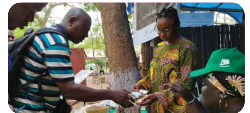
Working with communities to improve soils, nutrition and livelihoods.