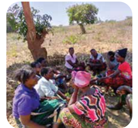
SFHC uses innovative training techniques to disseminate knowledge.